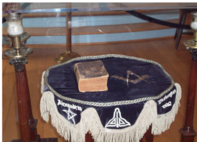
Alter supporting the famous "George Washington Bible"