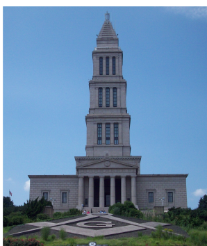
George Washington National Masonic Memorial

The trip to Washington D.C. was a great opportunity to have a good time with other Masons from around the State and to celebrate George Washington's 280 th Birthday, while 18 Fellow Crafts from Ohio were raised to the sublime degree of Master Mason on August 4 th , the 259 th anniversary of George Washington being raised to the sublime degree of Master Mason. The Master Mason